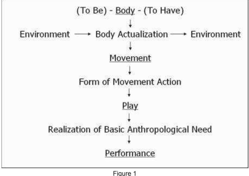
Anthropology Theory According to Grupe (1982)

This leads to three orientations that are characteristic for the interpretation of man by Grupe (1982): historical, sociocultural, and proactive. The philosophical–educational oriented anthropology of Grupe is summarized as follows: