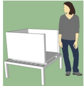
Figure 14 - Proposal for support for the storage box of painted parts

d) Activity 05 - recommended packaging guidelines to the worker, as the correct way to perform the movements. It is also recommended increasing the storage box about 40 cm higher than what is currently used; this will improve the movements (Figure 14).