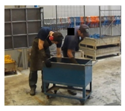
Figure 15 - Separating and storing the hooks

e) Activity 06 - separating and storing hooks - It is recommended that this task be interspersed with tasks in the sitting or walking position, in addition, for the activity it is considered important that the hooks to be separated are closer for the worker to reach. It has been proposed to manufacture new storage box, which have the measurements that allow them to be at below the elbow height and above the knees in front of or immediately next to the worker (Figure 16). With the manufacture of the new box to separate and store the hooks, it will also help the worker avoid tilting the head at the moment the hooks are separated in the bottom of the box; it will decrease the tension of the neck muscles that cause pain in the neck and shoulders.