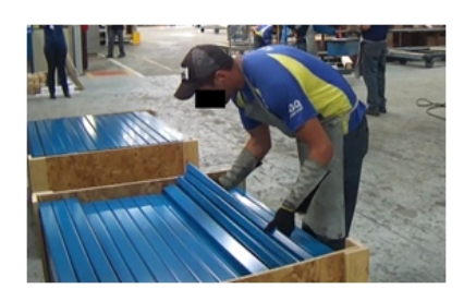
Figure 10 - Storage of the painted parts

Activity 5: The worker puts the pieces in storage boxes for later transport (Figure 10). During this activity a back flexion of greater than 60 ° occurs, aggravated a load of about 12kg (6 pieces).