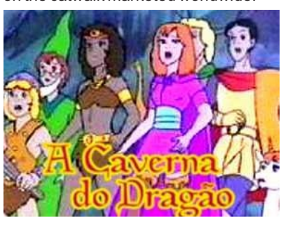
Figure 04: A Caverna do Dragão.

In the case of the cartoon "Dungeons and Dragons", it is worth noticing the presence of a black female character warrior. Although it has characters of his tribal ancestry, such as garments and curly hair, the figure also highlights the stereotypical traits of beauty: slender, thin, stubby breasts and buttocks, lean belly and thin waist, as it kept the European young ladies with their suffocating corsets at other times and currently appears - that of course by other means, methods and technologies - the standard of female beauty on the catwalk marketed worldwide.