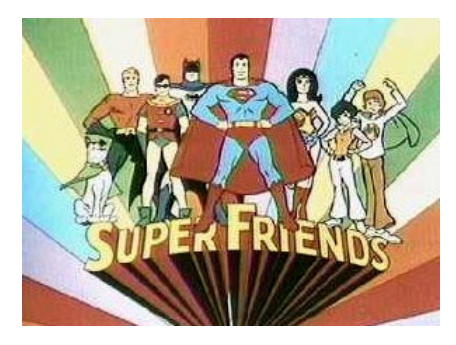
Figure 05: Super-Friends.

Another cartoon that deserves special mention is the Super Friends (or "Justice League" as it is known). With numerous and very different characters, this design keeps fairly common characteristics: they are all powerful, have physical and magical skills, they are good, even when need for this gross act, and, of course, are always skinny, tall, strong, muscular, intelligent and white. In this design also showed a sexist ideology, because only one woman had special powers: Wonder Woman, all the other figures were male. "The super-friends, drawing together various heroes, science also shows the side of good, being used to save the world from evildoers earthlings and aliens, as a support of American heroes" (Siqueira, 1998, p. 118).