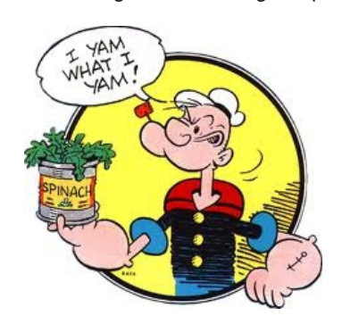
Figure 06: Popeye.

Finally, we discuss here about the Popeye and the gang. Apparently, it can be said that the characters in this design does not reflect the stereotype of the heroes of the other designs mentioned. In it appear chubby (Brutus and Dudu), skeletal characters, skinny excess (Olivia and the Sea Witch), elderly (Grandpa Popeye and the Sea Witch), besides the Popeye, a sailor clumsy, lanky, bald, smoking, stripped, which looks nothing like the male figures protagonists (heroic) of the other drawings.