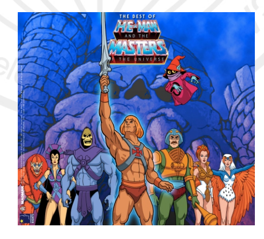
Figure 01: He-Man.

In order to realize the implications of socio-educational cartoons and the stereotyping of bodies exert on children of 80-90 years, the generation that today is the adult stage, we considered the following cartoons: Popeye, Super Friends, The Cave Dragon, He-Man, She-Ra and Thundercats. The choice of these drawings are given for being true icons of the time and because they illustrate well the theme of this study, featuring super-heroes as protagonists almost always "beautiful, strong, muscular, agile, living (...) brave, bold (...) with the spirit of initiative, tenacious, honest, modest "(Fusaro, 1985, p. 56).