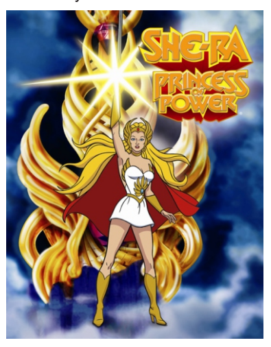
Figure 02: She-Ra.